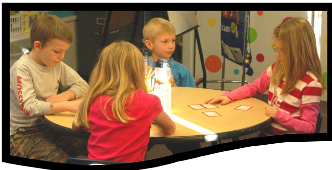
Elementary students engaging in reading drills.