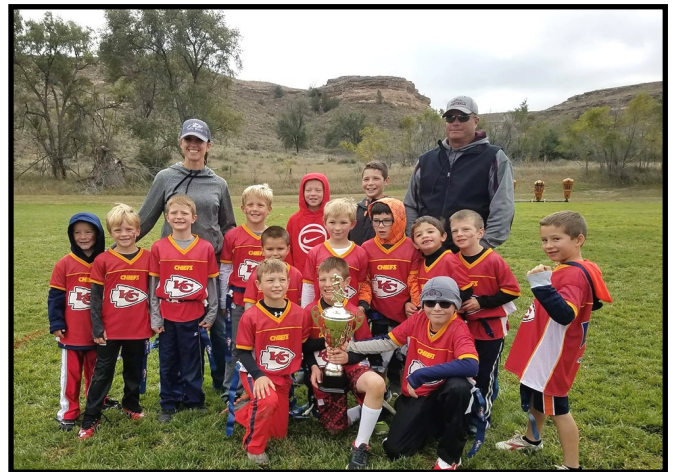
Congratulations Flag Football Champions for the Wray League