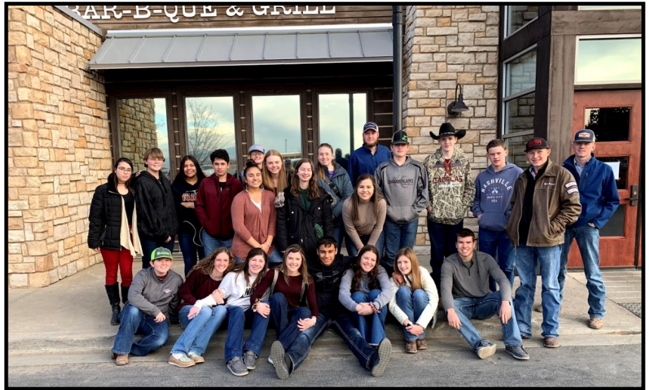
Twenty-four Idalia FFA members pictured outside of Nordy's Bar-B-Que & Grill.