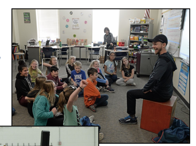
5th Grade Class