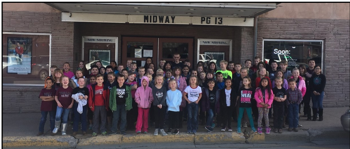
Elementary attend movie in Wray through Artist in Residence Program!