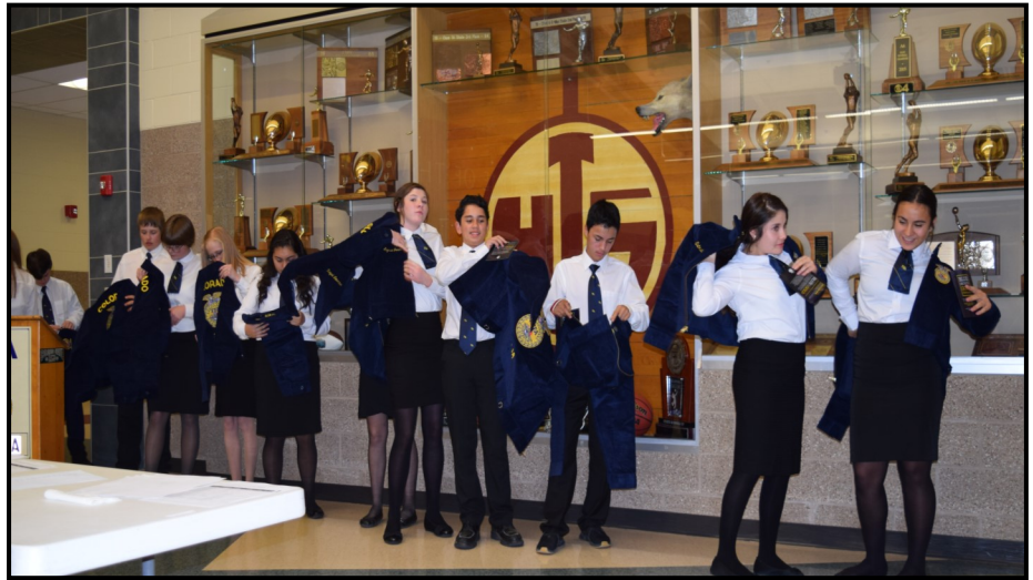
Freshmen putting on their new FFA jackets!

Thanks to everyone for supporting the FFA Fruit and Sausage sales.