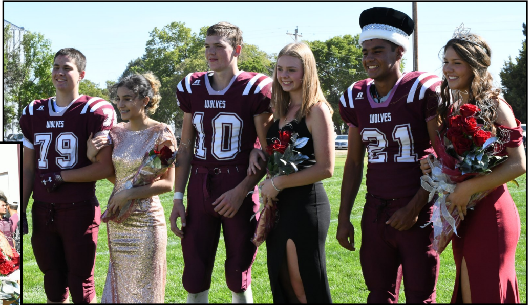
Homecoming 2021 — Royalty